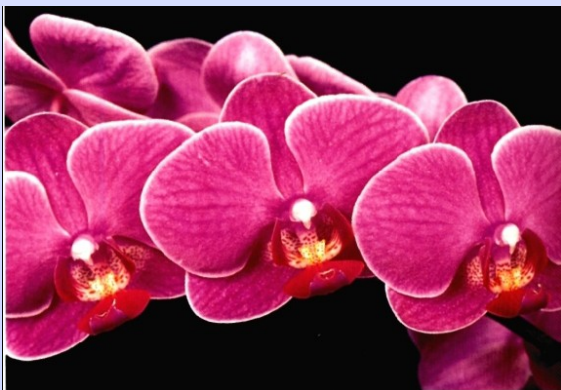
Phalaenopsis MALIBU MINUTE

In some ways, growing orchids in the home can be less demanding, as you are with them most of the time, making it easier to attend their needs more quickly and not leaving the task until you have time to spend in the greenhouse. Another advantage is that orchids adapt to the conditions in the home and don't have a specific environment created for them for example they are less likely to suffer from overheating in the home if you are out all day, which can so easily occur in a greenhouse, should the vents be left closed.