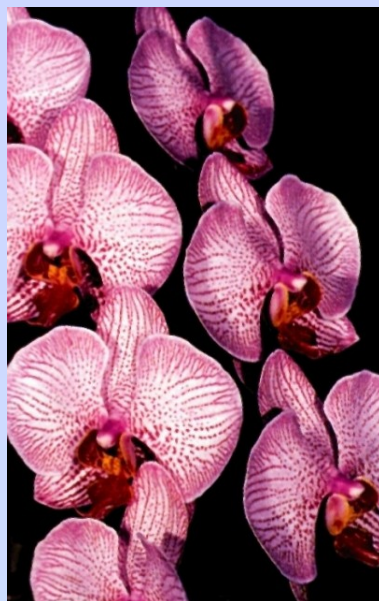
Phalaenopsis WILD DELIGHT

Only re-pot every 2-3 years using orchid compost. This can be done at any time of the year except winter.